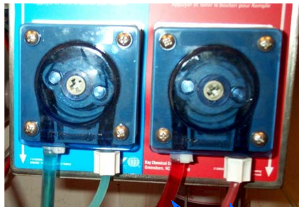
Sanitizer feed tube

Use the “white” (opaque) plastic tubing provided with the installation kit for both the Wash Tank and Sanitizer Tank discharge tubes. Run the tubes from the injector nozzles, located in the sides of the tanks, to the appropriate pumps. Cut the tubes to the correct length and connect the tubes between the injector nozzle and the “discharge” side of the appropriate dispenser pump using the supplied compression fittings.