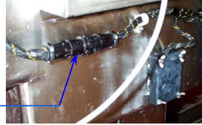
Multi-pin connector behind unit

Verify that the male and female multi-pin connectors of the wiring harness, between the two halves of the unit, are tightened and secure.