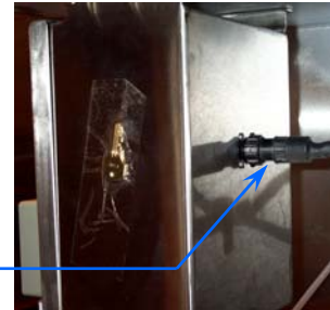
Multi-pin connector behind chemical dispenser

Locate the multi-pin connector that is underneath the clean drain board (behind the dual dispenser pump) and secure it to the back of the dispenser.