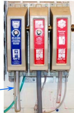
Shorten to 8"

Note: In a new store, this equipment may not yet be installed. If so, disregard this step.